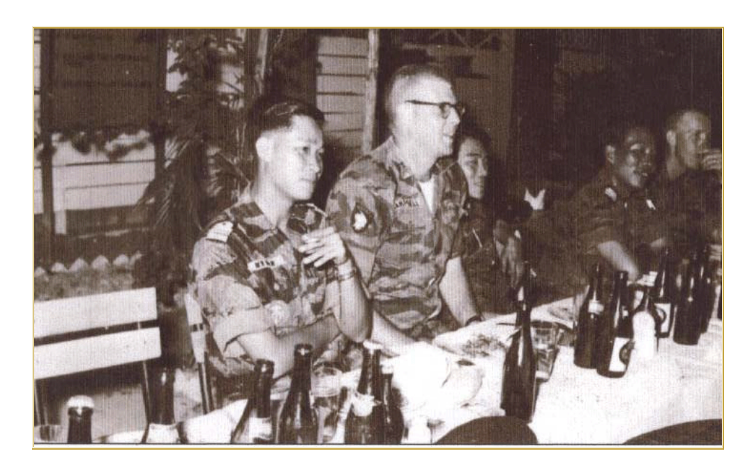
Victory party for the battalion at our Thu Duc base camp (67)

July was another down month as the battalion was again committed to riot control and antiterrorist operations for a national holiday. In August we went to the Vietnamese Training Center at Van Kiep just north of the beautiful seaside resort of Vung Tau. The training period was something every unit needed but few got. We had over two hundred replacements and it was the quickest way to get them up for operations and sure beat letting them learn in the middle of a firefight. The training center was run very unimaginatively by a phantom Vietnamese commander we never saw and two old U.S Army officers were the advisors. They were obviously senior to Gary Carlson and me but when the fat one started dashing into our billeting long houses and snatching up weapons not locked down or doing uninvited weapons inspections, I asked them, as a lowly subordinate, to knock off the crap. When I told them that was not the way to handle this battalion we had a philosophical parting of the ways. By then it was clear that they were part of the U. S Army clique who hated Marines for no reason except they perceived the Corps a threat to Army missions and tasks. Or maybe because we were all so arrogant towards anything not Marine, which we were.